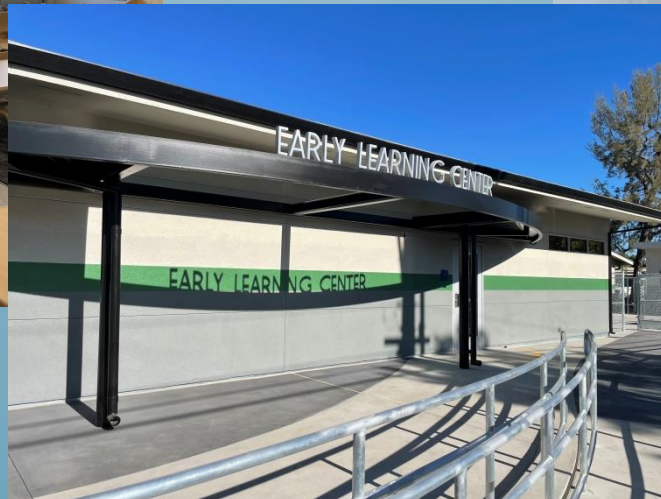
Early Learning Center